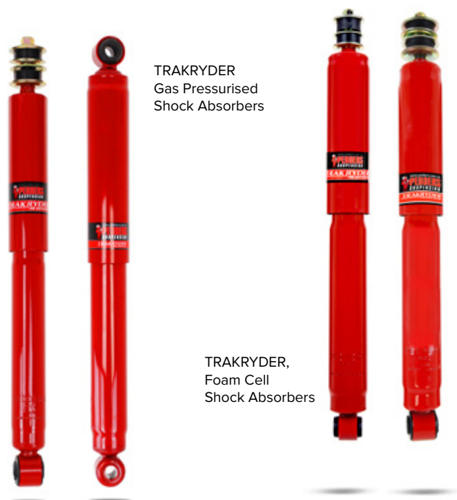
TRAKRYDER Gas Pressurised Shock Absorbers

Also included in our range is our premium Foam Cell shock absorbers which are ideal for constant or heavy load carrying and towing applications.