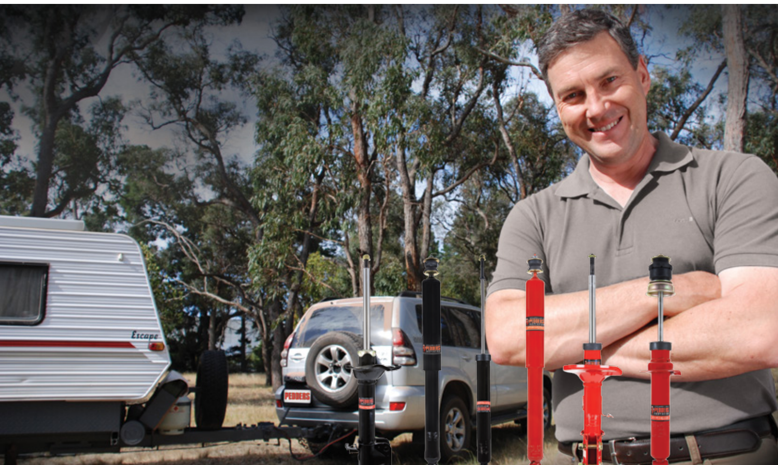
Pedders Shock Absorbers