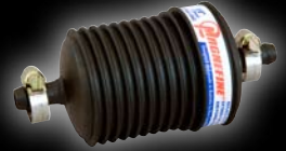
In Line Filter

Pedders also offers a comprehensive 28 point steering and suspension safety inspection in which all steering and suspension components are checked for condition and safety. These items are not covered by normal servicing and yet contribute greatly to a vehicle's handling, comfort, and safety.